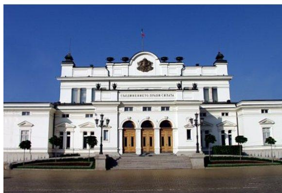
The House of Parliament