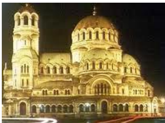
St. Alexander Nevski Cathedral