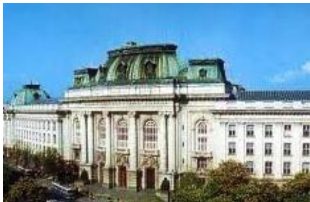
Sofia University St. Kliment Ohridski