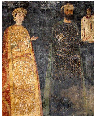
Fresco of the Boyana Church, 11 th Century

Sofia has had several names during the years but it remains as a great place to visit and will offer you a lot of surprises and unforgettable moments: skiing in the morning, attending a business meeting in the early afternoon, having dinner in a stylish restaurant in the evening and finish the day enjoying the company of your friends, singing and dancing in a live music club.